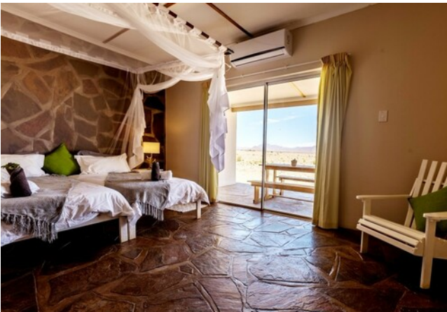
The Elegant Desert Lodge

You'll appreciate the sound of desert silence in Sesriem, the closest town (and gateway) to the sand dunes of Sossusvlei. Apart from the views from the town which look one way towards the sand dunes and the other to the Naukluft Mountains, you can enjoy the quiet, sandy streets, and the powerful feeling that you're deep in the Namib Desert.