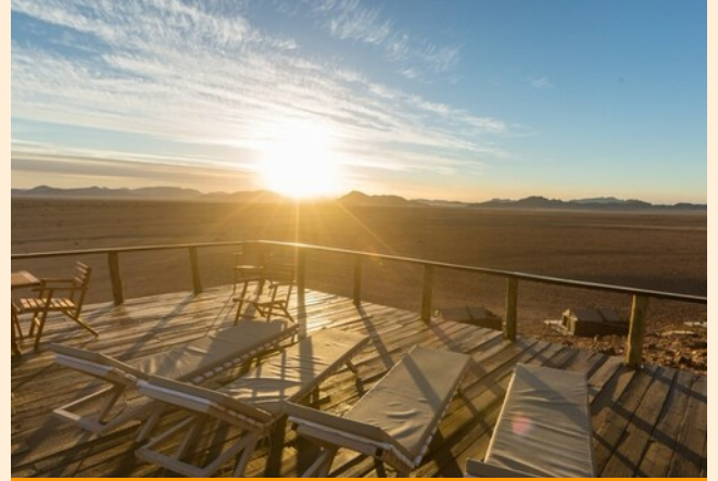
View from accommodation

The Elegant Desert Lodge is your base for exploring Namib-Naukluft National Park with us, and you'll really enjoy staying here.