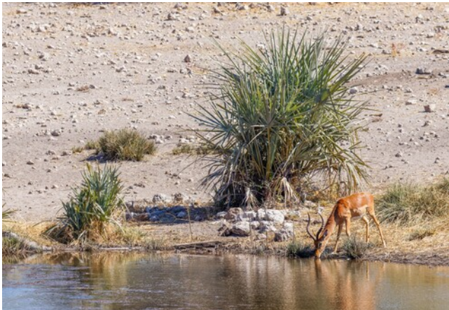
Onguma Game Reserve