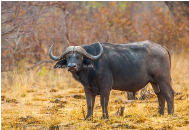
Mahango Game Reserve