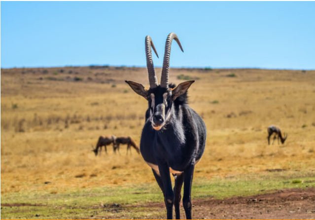
Mahango Game Reserve