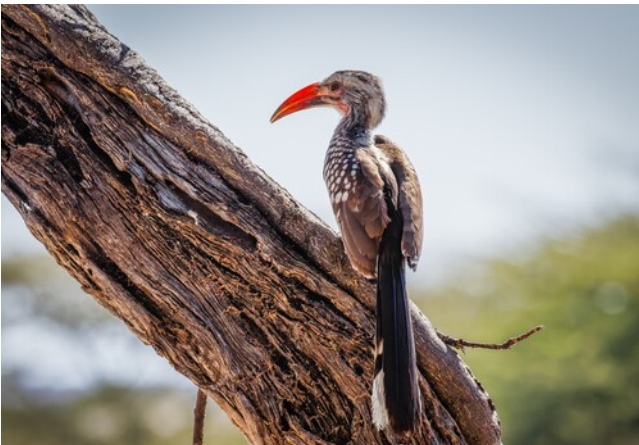
Onguma Game Reserve