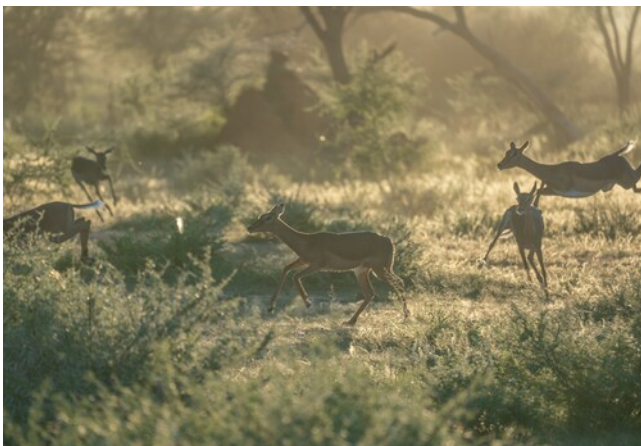
Okonjima Nature Reserve

Combine conservation with a wildlife safari at Okonjima Nature Reserve, a private sanctuary run by AfriCat Foundation which is doing important work in protecting some of southern Africa's most important species. While you're here, go looking for leopards, African wild dogs and cheetahs. Sightings of pangolins and brown hyenas are also possible.