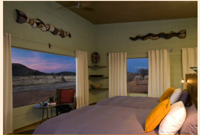
Okonjima Plains Camp

Part of AfriCat's excellent Okonjima Nature Reserve, Okonjima Plains Camp has beautiful rooms, all nicely spaced from each other and with big views out over the grasslands where plenty of wildlife can be seen. Local safari colors and decor brighten the large, appealing rooms, and the bar, restaurant, gift shop and swimming pool are all nicely done.