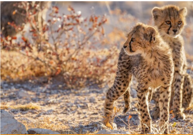
Onguma Game Reserve