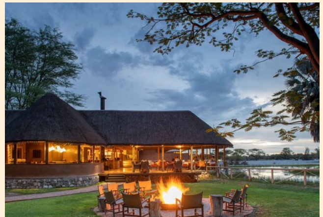
View of fire-pit across to restaurant and bar overlooking