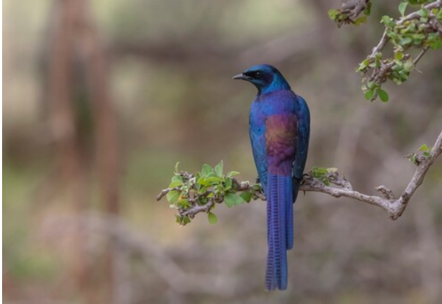
Mahango Game Reserve

The large elephant herds coming down to drink and swim along the Okavango River and surrounding flood plains will be a highlight of your visit to Mahango Game Reserve, part of Bwabwata National Park. Expect also crocs, hippos and other animals too.