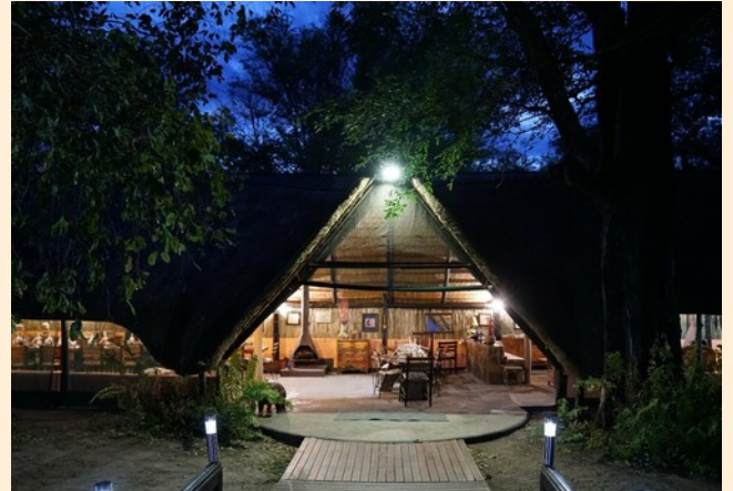
Ndhovu Safari Lodge

Lodge | Just outside Mahango Game Reserve