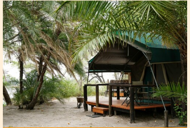
Ndhovu Safari Lodge