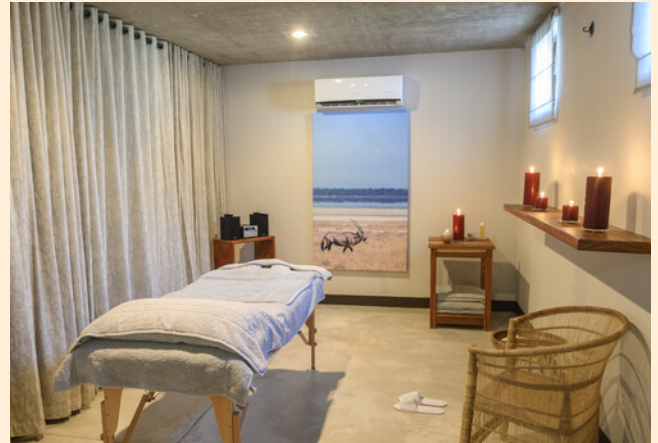
Onguma Bush Camp

When you stay at Onguma Bush Camp, you're in a good location to enjoy this leg of your trip.