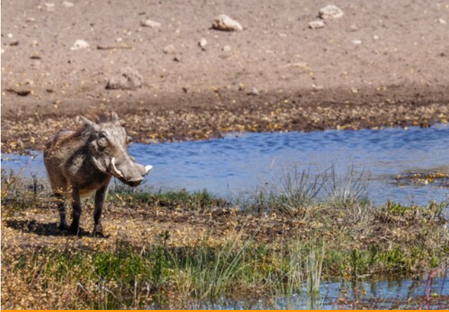
Onguma Game Reserve

Spend another night in Onguma Bush Camp.