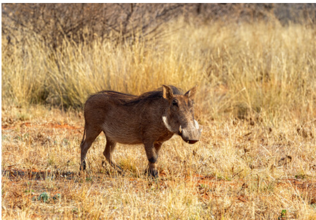
Okonjima Nature Reserve