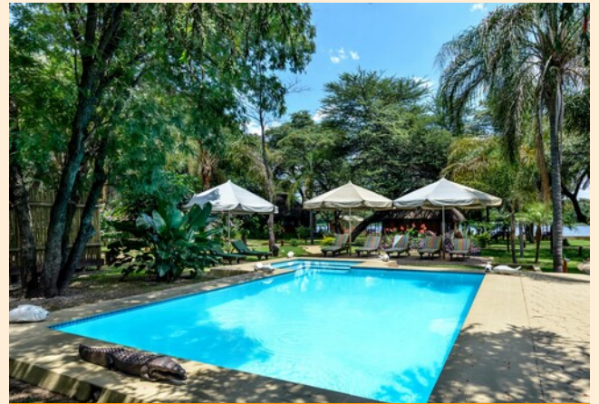
Hakusembe River Lodge

Just about as far north as you can go in Namibia without spilling over into Angola, Hakusembe River Lodge, close to Rundu, is a terrific place to stay. You're right by the Cubango River, and facilities include large rooms with high, thatched roofs, a bar and dining area, and a swimming pool. You'll want to sit on the hotel's deck and enjoy the views forever.