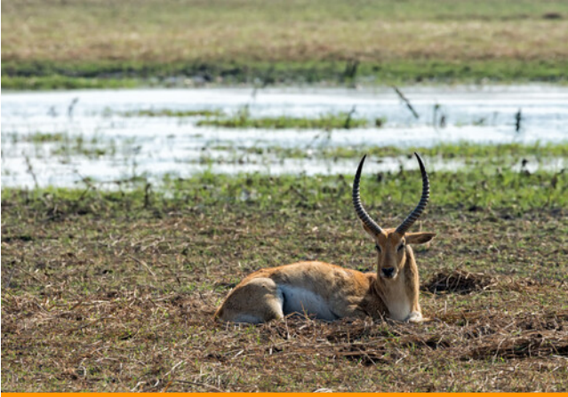
Mahango Game Reserve