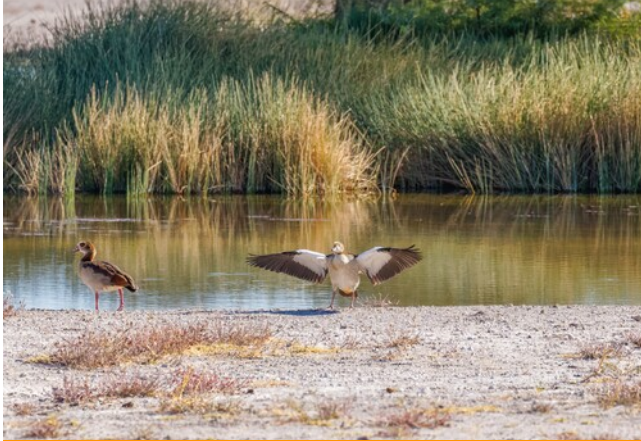
Onguma Game Reserve

At Onguma Game Reserve it can feel like you're on your own private safari. It's right next to the eastern boundary of Etosha National Park and has many of the same animals, but the reserve is more exclusive and safari trails are much quieter.