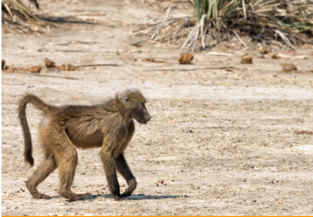
Mahango Game Reserve