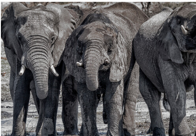
Mahango Game Reserve