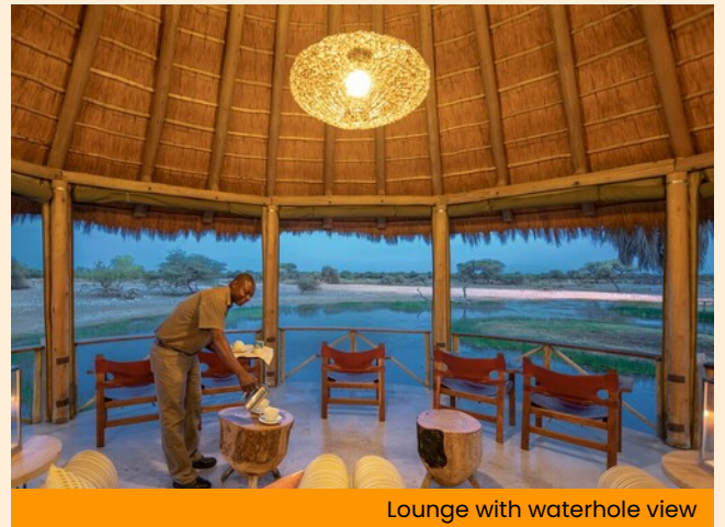
Lounge with waterhole view