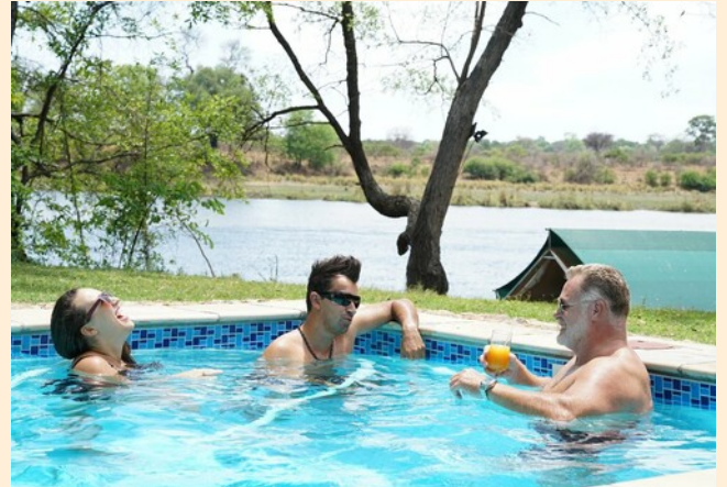
Ndhovu Safari Lodge

Get to know the area and all it has to offer when you stay at Ndhovu Safari Lodge quote.just_inside Bwabwata National Park. The lodge's facilities include A swimming pool, a bar and a restaurant.