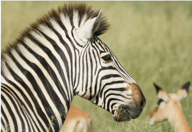
Mahango Game Reserve