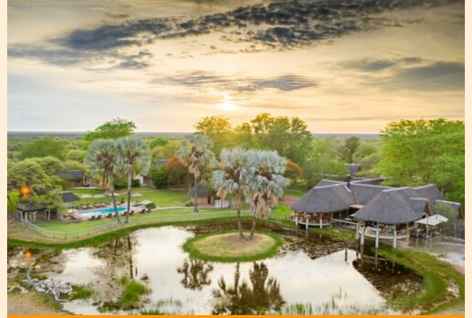
Onguma Bush Camp