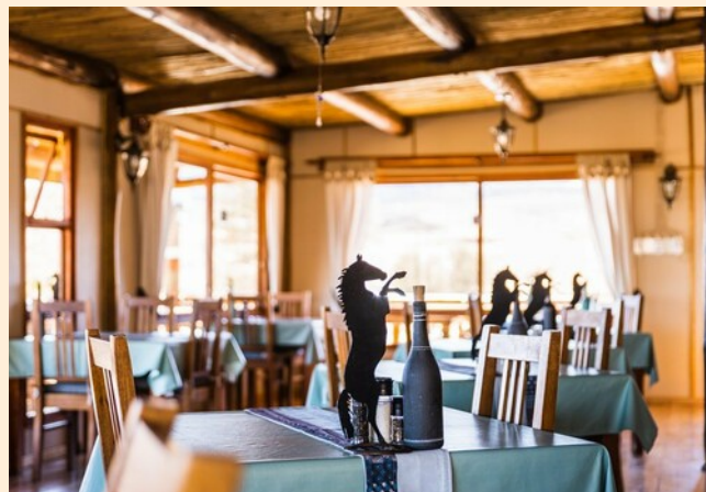
Klein-Aus Vista - Desert Horse Inn