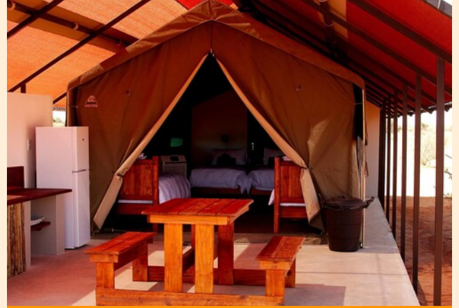
Kalahari Anib Camping2Go

There's so much for you to enjoy when you stay at Kalahari Anib Camping2Go, which puts you in the perfect position to enjoy this leg of your safari.