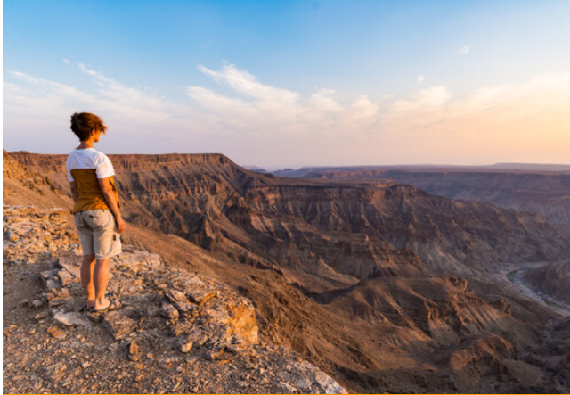
Fish River Canyon

Gaze in awe and wonder at the beauty of Fish River Canyon, one of Namibia's most spectacular sights. The views here from the lookouts and walking trails short and long are among the best anywhere in the continent's south.