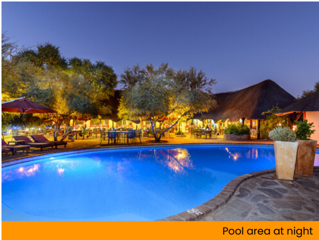
Pool area at night