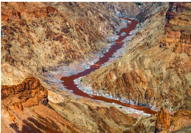
Fish River Canyon