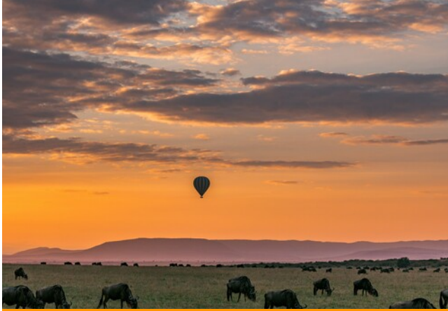
Balloon at dawn

Soak up the silence of Sesriem, the town which lies at the entrance to the sand dunes of Sossusvlei. It's lovely and quiet, with big views of the sand seas just beyond the town, and of the Naukluft Mountains nearby. Hotels, lodges and tented camps line the roadside and the desert begins very close by.