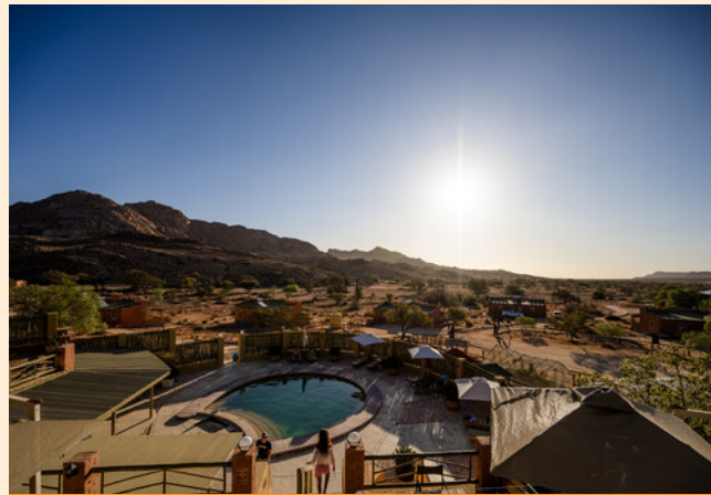
View overlooking the pool