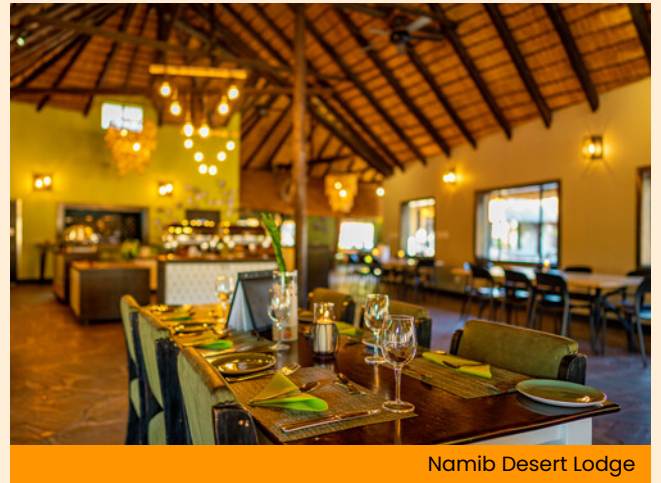
Namib Desert Lodge