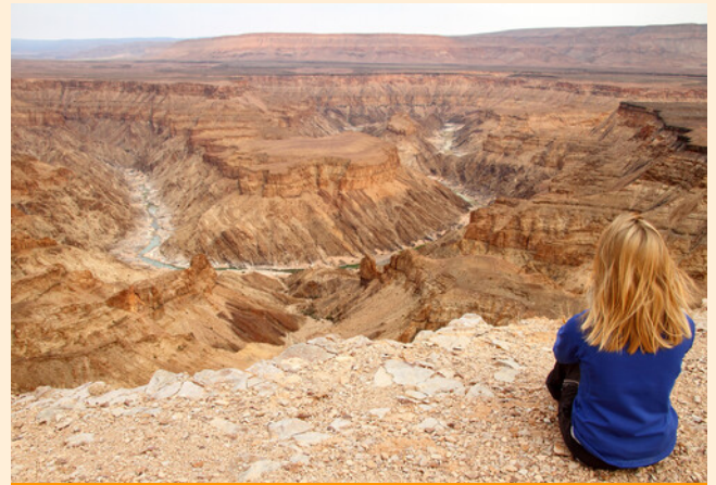
Fish River Canyon