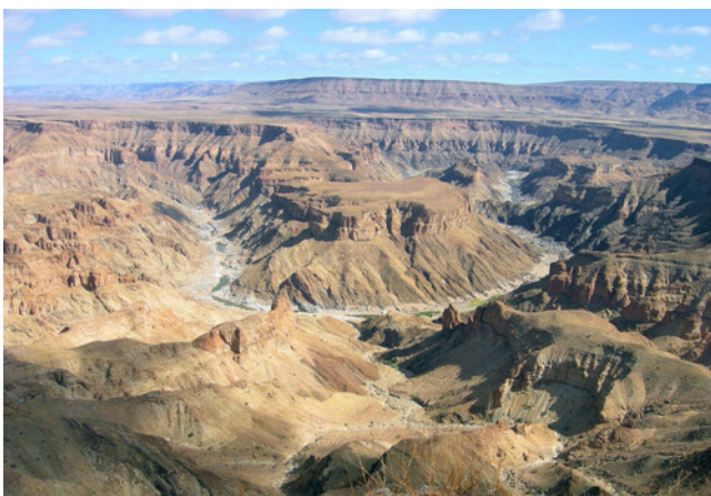
Fish River Canyon