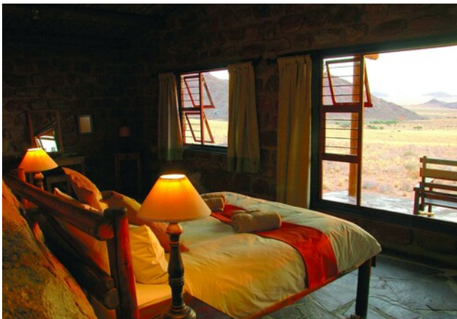
Room with a view