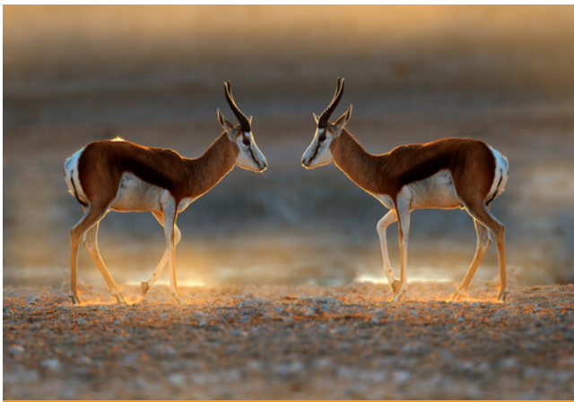
Etosha National Park

You're going to love Etosha National Park, which is one of the best places to see wildlife in all of southern Africa. Watch for lions hunting by the waterholes, and you can't miss the elephants cloaked in white Etosha dust. Rhinos draw near to the waterholes by the camps after dark, and leopards are also possible here. And don't forget the scenery: the vast and mesmerizing salt pans that are such a feature of the park are simply stunning.