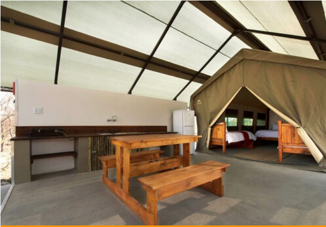
Etosha Safari Camping2Go