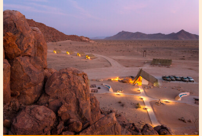
Desert Quiver Camp

You'll enjoy your time at Desert Quiver Camp. It's a great place to stay in a good location.