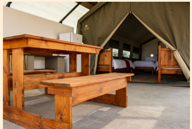
Etosha Safari Camping2Go patio