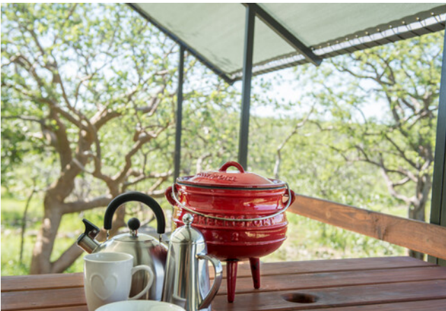
Etosha Safari Camping2Go cookware