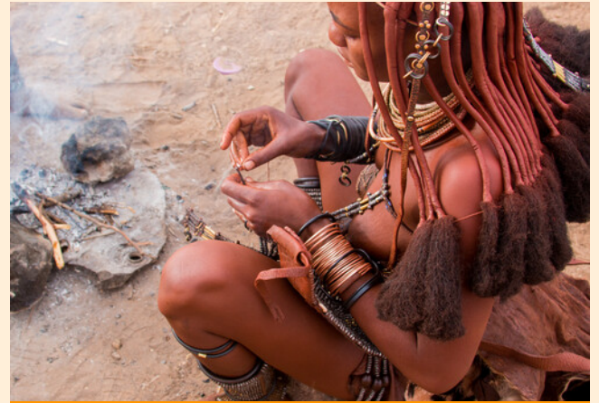
Learn about Himba life.

You'll be staying at Alte Brücke Holiday Resort while you're in Swakopmund. You'll love staying here.