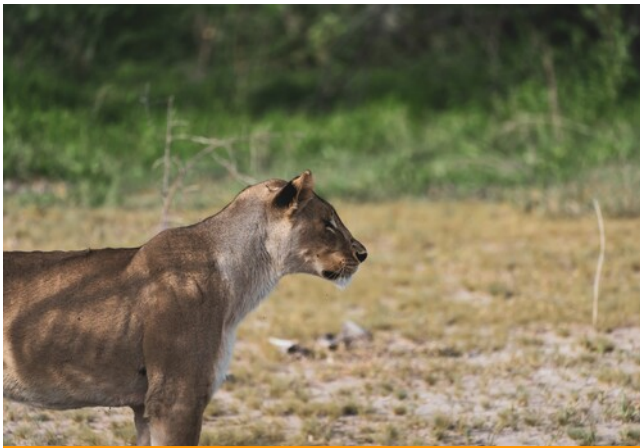
Etosha National Park