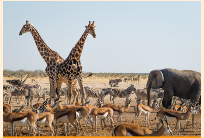
Etosha National Park