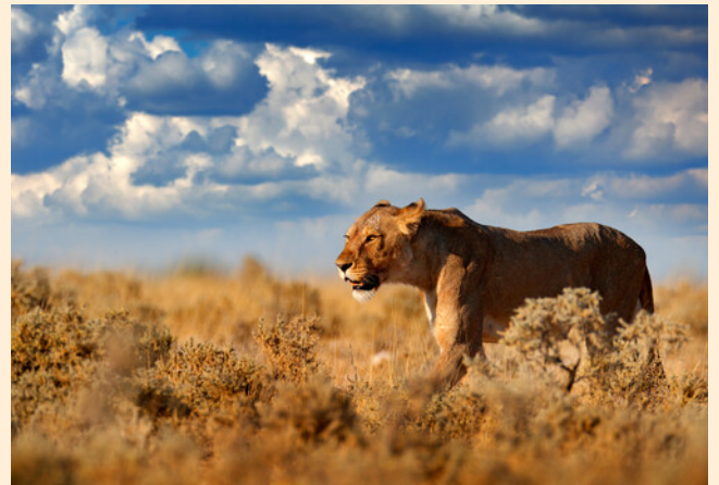
Etosha National Park