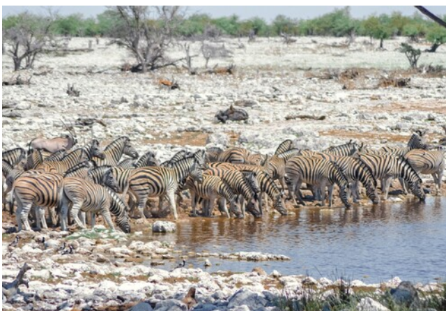
Etosha National Park