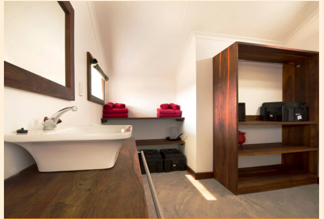
Etosha Safari Camping2Go bathroom