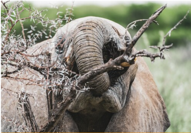
Etosha National Park

Return to Etosha National Park and get to know it even better.