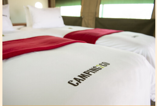
Etosha Safari Camping2Go

There's so much for you to enjoy when you stay at Etosha Safari Camping2Go, which puts you in the perfect position to enjoy this leg of your safari.