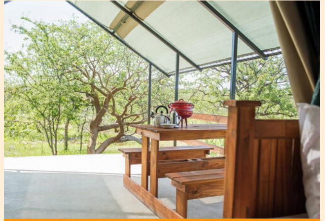
Etosha Safari Camping2Go patio