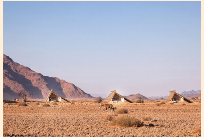
Desert Quiver Camp Units