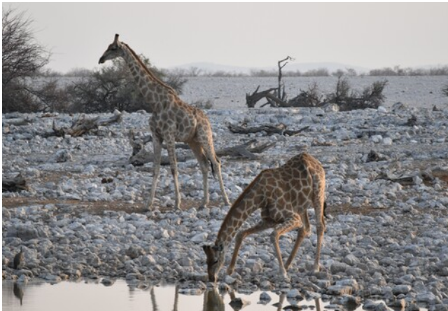
Etosha National Park